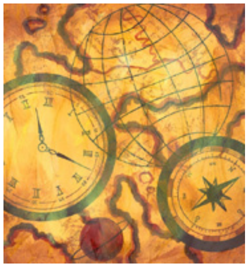
Creativity goes a long way on your commute.