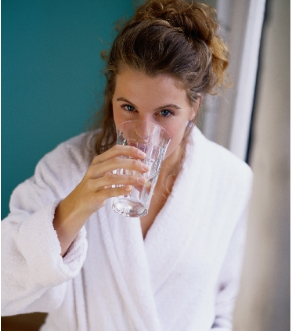
To get the full benefits of massage, take it easy after your session and let it soak in.

The benefits of massage are diverse. No matter how great it feels, massage isn't just a luxury; it's a health necessity.